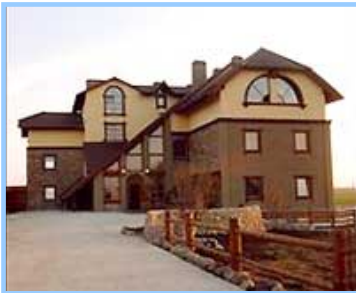
"Goryachie Kluchi" hotel

Hotel "Goryachie Kluchi" 4* and hotel "Suzdal" 3 *